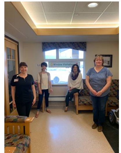
Staff at Bethesda Place sharing a visual of the Visitation Window.

verbal consent to share was provided by all individuals in this photo.