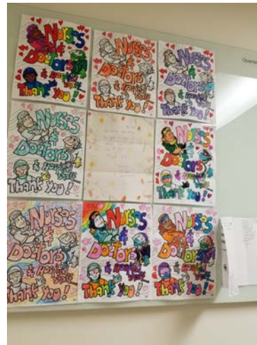
Thank you posters displayed at Portage District General Hospital.